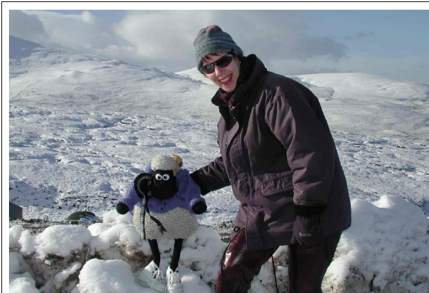
Fiona and Shaun the Sheep promise a warm welcome on the Highland Fling Tour later this year. (Photo - Cairngorms late Oct 2002)

The moral of this seems to be - follow the recommended safety rules and reverse into any parking space for a quick get away and don't get out to remove any bits of paper. If you are an advanced driver, you'll have given your car the once over as you approach and if it does have suspicious bits of paper on it, then look